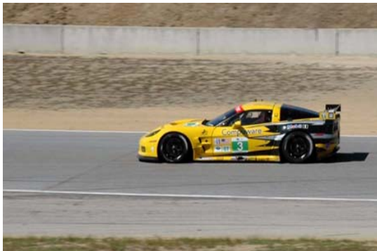
The No. 3 roars by at turn 10.

few bottles of the local vineyard products.