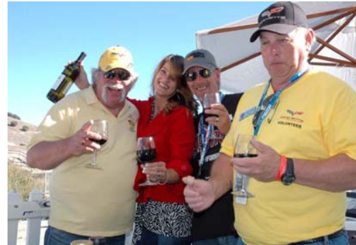
The wine tasting during the race added spice.

Western States Corvette Council was formed to serve as a link for, and to assist Corvette clubs throughout the west in inter-communication, cooperation, interclub events and to promote the image and to direct