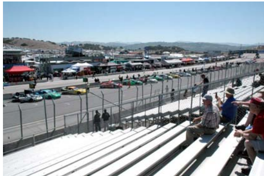
The starting grid along the front straight.

The big ALMS round 8 race was on Saturday. It started in the afternoon so we had plenty of early time to browse the rows and rows of automotive and racing sales kiosks and sample the BBQ and other great foods. Of course, being in California, there is a wine tasting tent manned with lovely lady wine sellers offering local cheeses and crackers to sample with the not so small wine pourings. CCU spent a lot of time at the tastings and of course, came home with a