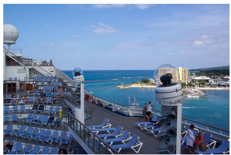
WESTERN CARIBBEAN CRUISE

On Nov 3<sup>rd</sup>, several members of the Corvette Club took a different type of cruise, this time by Carnival Cruise ship, to Cozumel, Grand Cayman Island, and Jamaica. The weather was great and where else could you hold a stingray or be kissed by a porpoise. Corvettes were spotted in Cozumel, Grand Cayman, and Miami. Everyone put on a few pounds as we ate, ate, and ate. Sleeping was optional. This has become an annual event and next year it is off to the Easter Caribbean sometime around the 1<sup>st</sup> week of November.