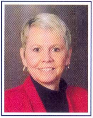
Owned And Operated By NRT Incorporated.