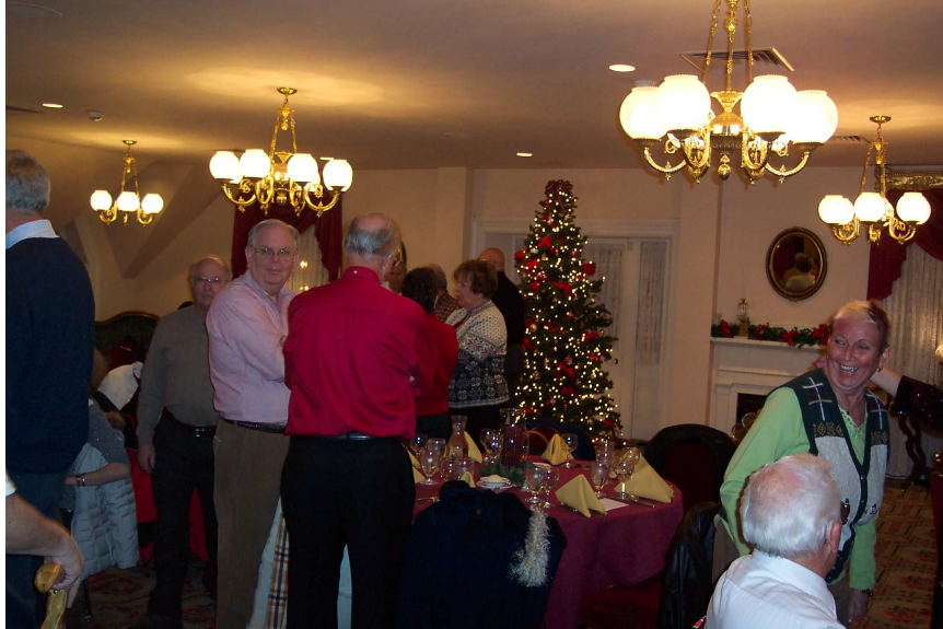
CCU CHRISTMAS PARTY

The December Birthday Dinner was held on Dec 7 th at Rib City in Sandy. The weather was nice enough for a cruise, but only dinner was held. Members with birthdays in December were recognized. If you are suffering from Cabin Fever, come join us for the birthday recognition meals.