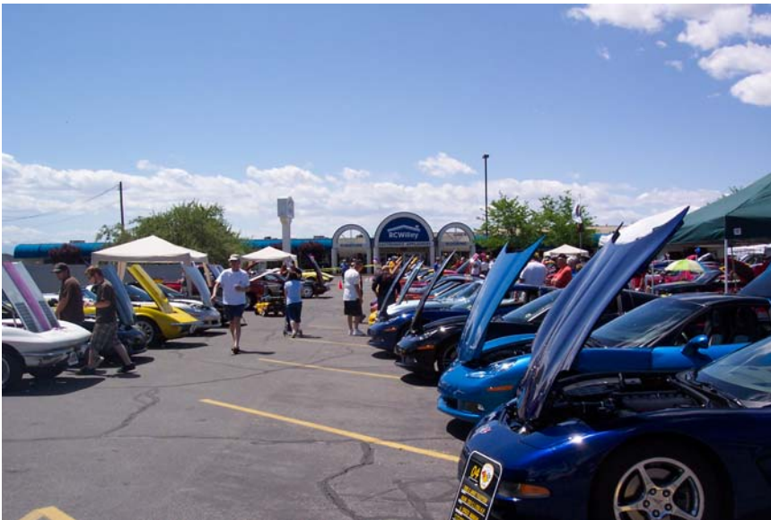
RC WILLEY 5 TH ANNUAL CAR SHOW

We had a great turn out the RC Willey's 5 th Annual Car Show on June 6 th . We put the mustang club to shame. As promised, hot dogs and drinks were furnished. Everyone received a door prize (A Key Chain Flashlight) followed by some great raffle prizes, the best being a flat screen television. The weather was great and it was a steady crowd. For those of us that got raffle prizes bigger than our Corvettes, RC Willey provided free home delivery.