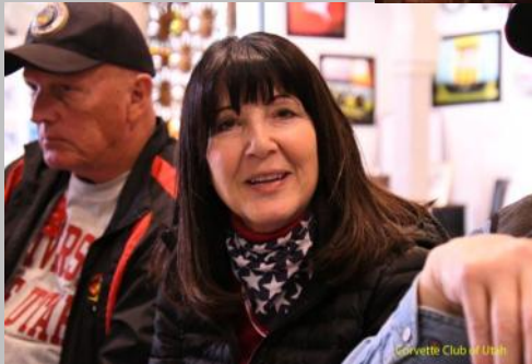
February Meeting & Valentine's Social