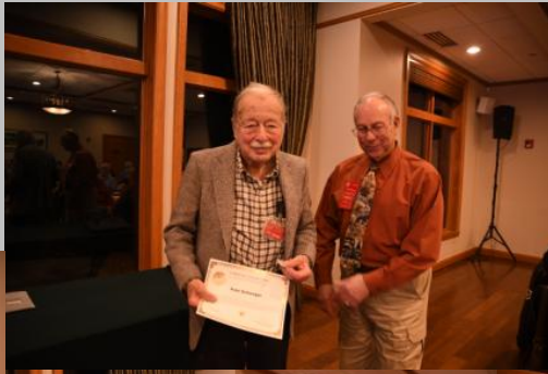
Award's Banquet Oakridge Country Club