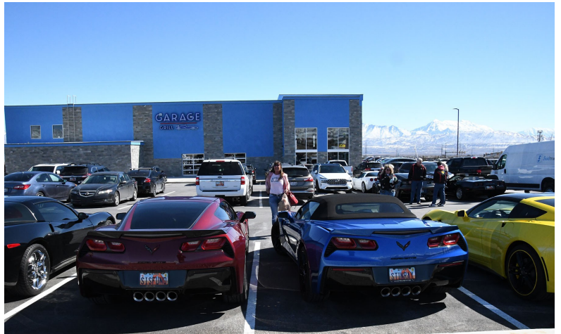
Corvette Club of Utah

It was a sunny spring-like day, with temperatures in the mid 50's. The food was wonderful and everyone had a great time getting together with their friends.