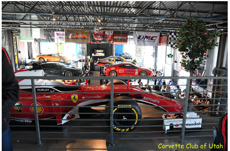
Corvette Club of Utah