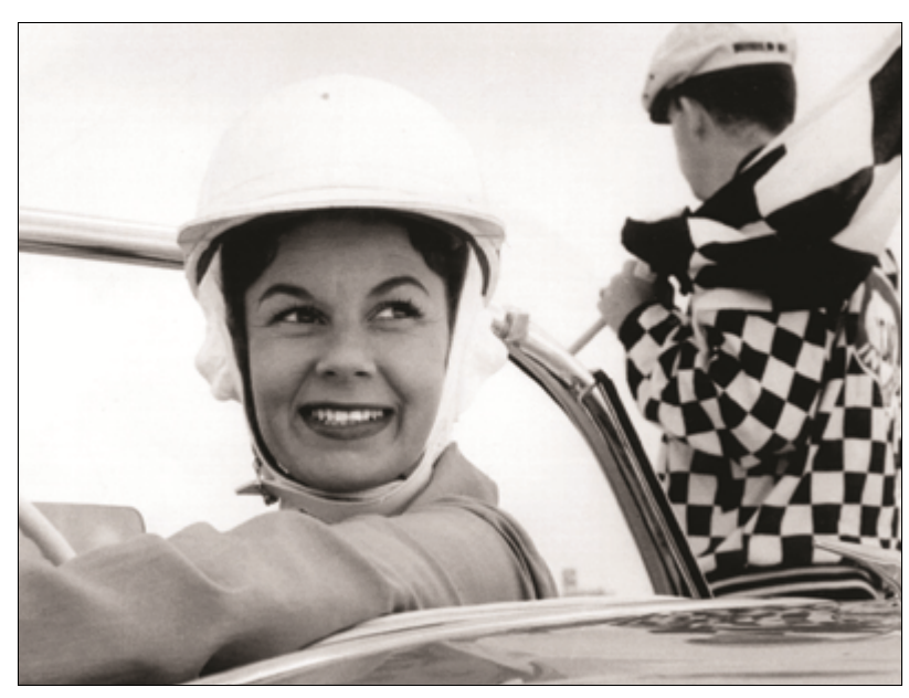
June 28, 1926 – August 31, 2011

Betty Skelton (Frankman), frequently referred to as the "first lady of firsts", worked side-by-side with some of the biggest names in Corvette, and established unbelievable records of her own in racing, aviation and automotive history. The first woman to be inducted in to the Corvette Hall of Fame was also the first woman in the world to drive racing cars to new records through the famous NASCAR measured mile on the sands of Daytona Beach. Skelton established records for Chevrolet behind the wheel of the Corvette, and appeared at major auto shows, as well as national ads and TV commercials.