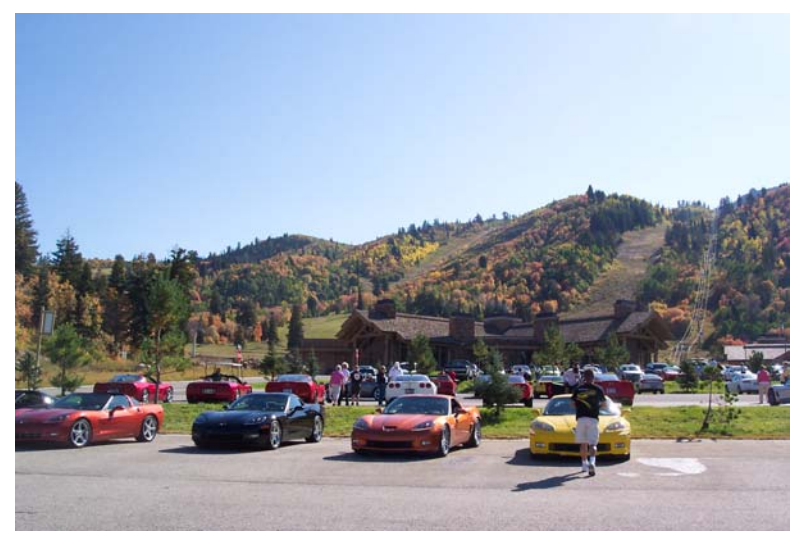
BIRTHDAY BREAKFAST AND FALL LEAF CRUISE

The annual Fall Leaf Cruise was combined with the September Birthday Breakfast and held on September 27<sup>th</sup> at Home Town Buffet in Layton. After breakfast, the names of members with Birthday's in September were read and 30 Corvette's headed out on I-15 to see the Fall Colors. The cruise started out by going up to Logan Canyon and stopping in Garden City for Strawberry Shakes. We then headed up Monte Cristo where the leaves were spectacular. It was then up the old Snow Basin Road to the Snow Basin Ski Resort. We then went over East Canyon into Salt Lake where we had dinner at the Macaroni Grill. The Cheesecake Factory had a two hour waiting list. This was the last cruise for the year and we hoped everyone enjoyed the cruises for this year.