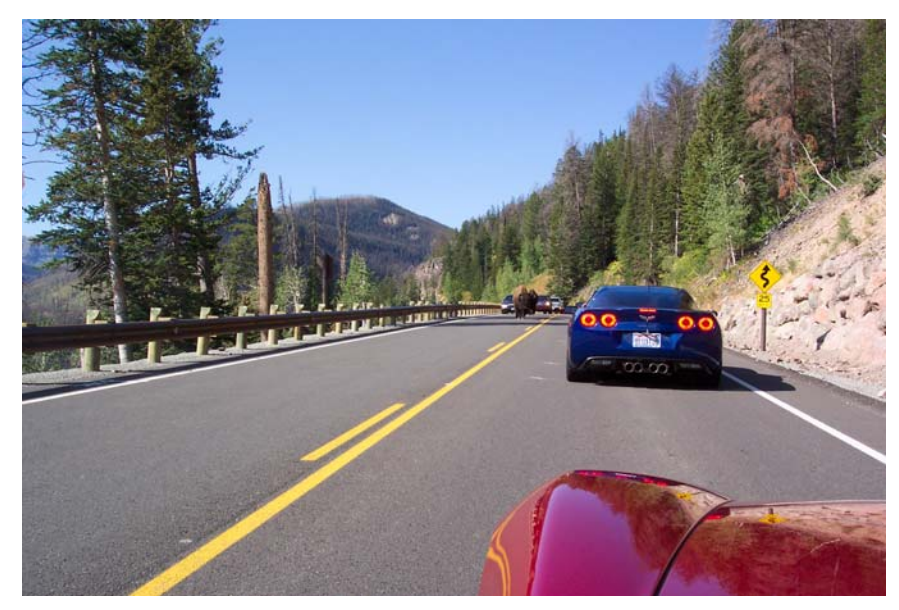
BEARTOOTH & YELLOWSTONE CRUISE - SEPT 11<sup>TH</sup> - 14<sup>TH</sup>

This was the last overnight cruise of the year and it was spectacular. We enjoyed sunny days the entire trip and the views were unbelievable. It started out with a quick cruise up to West Yellowstone where we enjoyed dinner at Bullwinkle's. Unfortunately, the only bears we saw were at the Grizzly and Wolf Sanctuary in West Yellowstone.