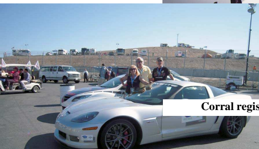
Corral registration on Friday morning.