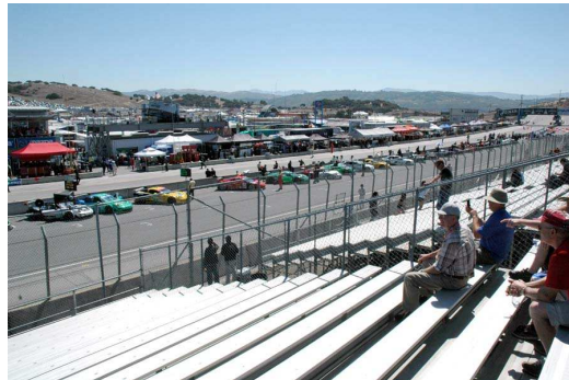
The starting grid along the front straight.

The big ALMS round 8 in the afternoon so we the rows and rows of kiosks and sample the course, being in tent manned with lovely cheeses and crackers to pourings. CCU spent a course, came home with products.