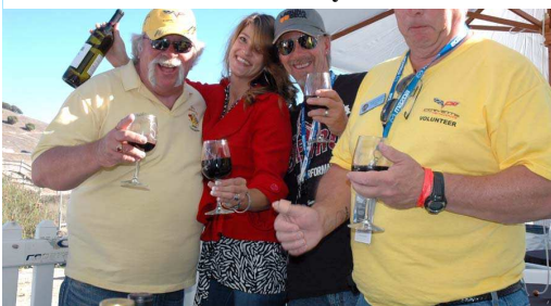
The wine tasting during the race added spice.

On Sunday we left Salinas as a CCU group, a topsless drive down beautiful Hwy 1 the coast highway for a visit to Hearst Castle in San Simeon. If you have seen the castle, you know what we are talking about – a classic architectural marvel. If you haven't seen it you are in for a treat. Following the castle we all split up. Some went north and some went south to continue their trip. We went south to the beautiful Old World Danish town of Solvang, CA. Awesome restaurants, and shopping opportunities for the girls that you wouldn't believe. Cute shops and boutiques and all in the heart of the Santa Barbara wine region. There were more wine tastings, shopping, beer and sausage and more shopping and wine tasting. Solvang is the place.