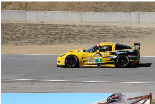
The No. 3 roars by at turn 10.

flag start of the race from the the pits. The roar has to be heard powerful race cars in four different the first hairpin turn is a sight to see. It was an amazing racing event. The race lasted 6 hours which gave us plenty of time to walk the track and see the race from all angles, particularly the Corkscrew at turn 8.