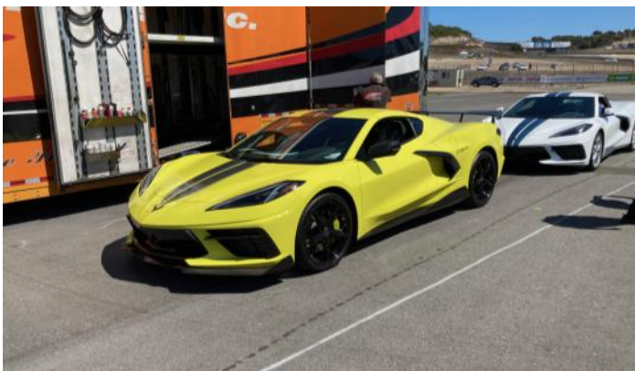
C8R Special Edition Corvette

The cruise to Laguna Seca turned out to be a cruise for one, but it was worth it. At the Corvette Corral, GM brought a covered transporter with both the Yellow and Silver C8R Special Edition Corvette. They only unloaded the Yellow Corvette and another C8 Roadster. The C8R Special Edition is a pretty good looking Corvette. We had speakers from Michelin, Mobil, and the Corvette Engineering Team. This was the first outing for the Engineering Team since COVID isolation and they were pretty eager to get out and talk to the Corvette Owners, especially C8 Owners. We tried to squeeze them about the Z06 but they had no comments except it will be formally revealed on Oct 26th and will be worth the wait. Finally,