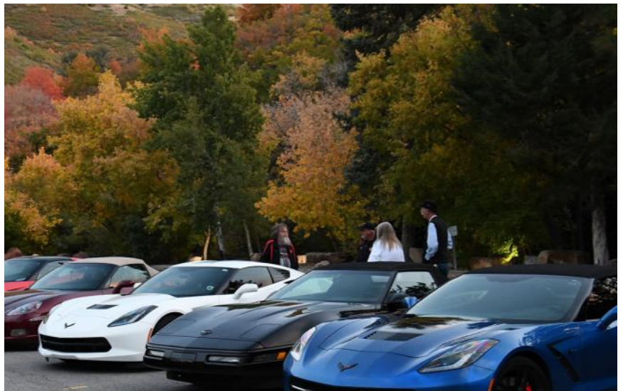
RUTH'S DINER, IMMIGRATION CANYON

Corvette Club of Utah P.O. Box 1134 Sandy, UT 84091