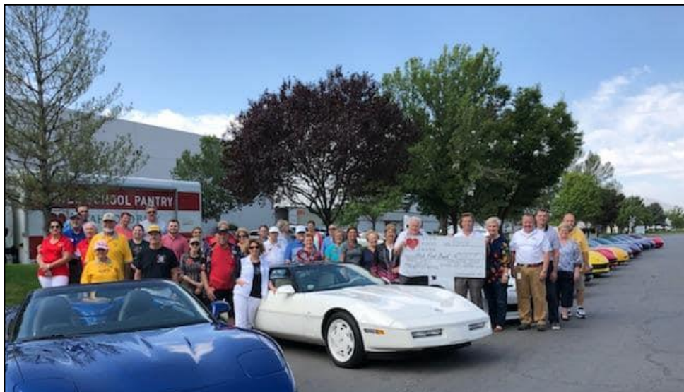
Here we are presenting our $5,000 check to The Utah Food Bank – September 24 th . A proud moment indeed!

To submit information for publication in the Sept/Oct 2018 issue of the Vette Gazette , please submit your information to the Gazette Editor, Annamarie Forbes, no later than Friday, Oct 19th. Email address: ccu.gazette@corvett eclubofutah.org