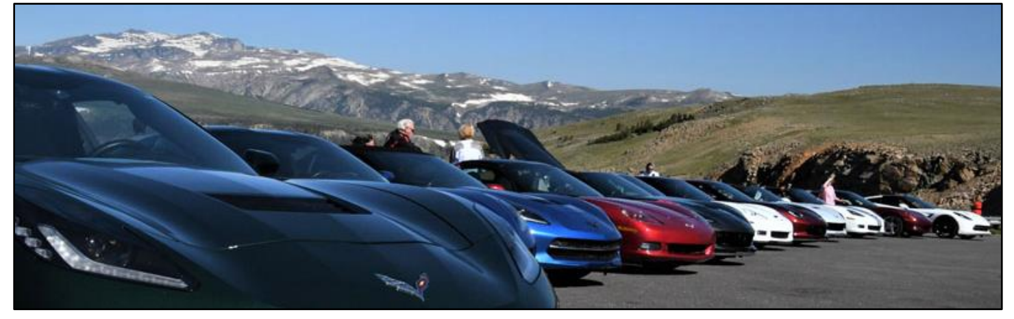
Cody, WY / Yellowstone / Beartooth Highway, July 18th-21st