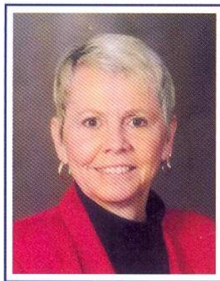
Owned And Operated By NRT Incorporated.