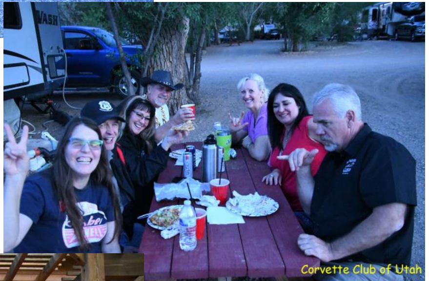
Corvette Club of Utah