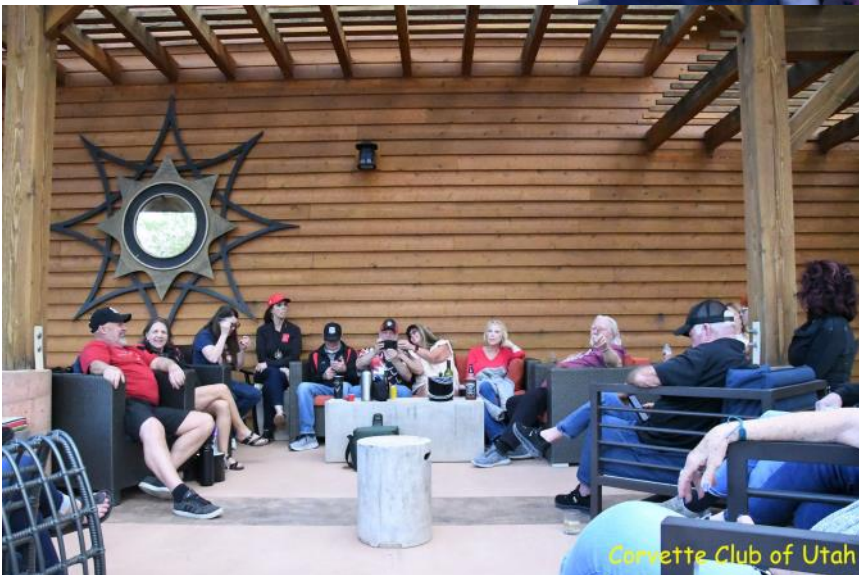
Corvette Club of Utah