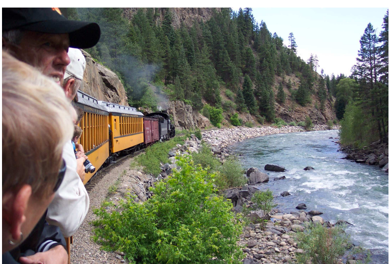
CCU CORVETTE AND RAILROADS CRUISE JUL 11-16TH

The July Birthday Dinner and Cruise was held on July 8<sup>th</sup>. Trying to save some gas and beat the sweltering heating, the club took a cruise up Cottonwood Canyon to the Brighton Resort. They spent a couple of hours looking around and cooling off. The cruise was followed with lunch at the Beijing Chinese Restaurant where the names of members with birthdays in July were read.