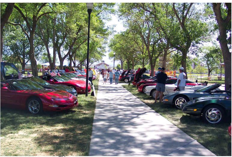
4<sup>TH</sup> OF JULY AT SOUTH JORDAN