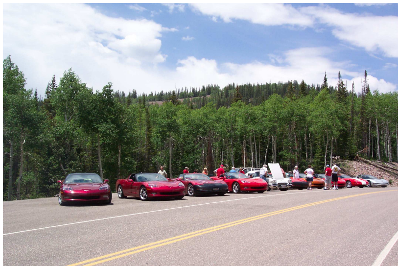
BUTCH CASSIDY DAYS AT BEAVER – JULY 4 TH & 5 TH